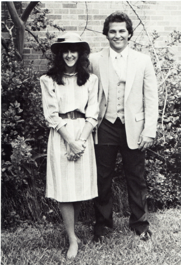
SENIOR CLASS FAVORITES